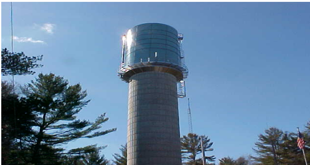
New Glen Charlie Road Storage Tank

Radon is a radioactive gas that you cannot see, taste, or smell. Radon can move up through the ground and into a home through cracks in the foundation. Radon can build up to high levels in all types of homes. Radon can also be released from tap water when showering, washing dishes, or doing other household activities. Compared to radon entering the home through soil, radon from tap water will in most cases be a small source of radon in indoor air. Radon is a known human carcinogen. Breathing air-containing radon can lead to lung cancer. Drinking water containing radon may also cause increase risk of stomach cancer. If you are concerned about radon in your home, test the air in your home. Testing is inexpensive and easy. Fix your home if the level of radon in your air is 4 Pico curies per liter of air (pCi/l) or higher. There are simple ways to fix a radon problem that are not too costly. For additional information, call your State radon program or call EPA's Radon Hotline (800.SOS.RADON)