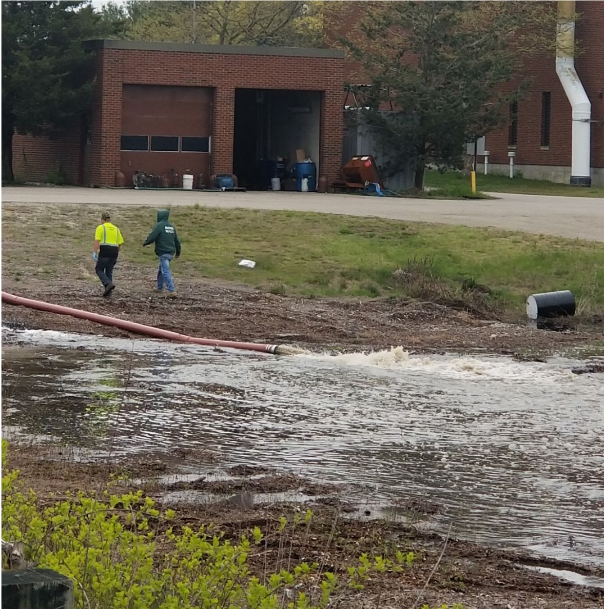
Figure 2.1 Non-Permitted Diversion at WPCF

and must be reported to Mass DEP. A number of these diversions have taken place at the WPCF in the last three years including prolonged diversions in spring 2018 and spring 2019. A photograph of the diversion is presented below.