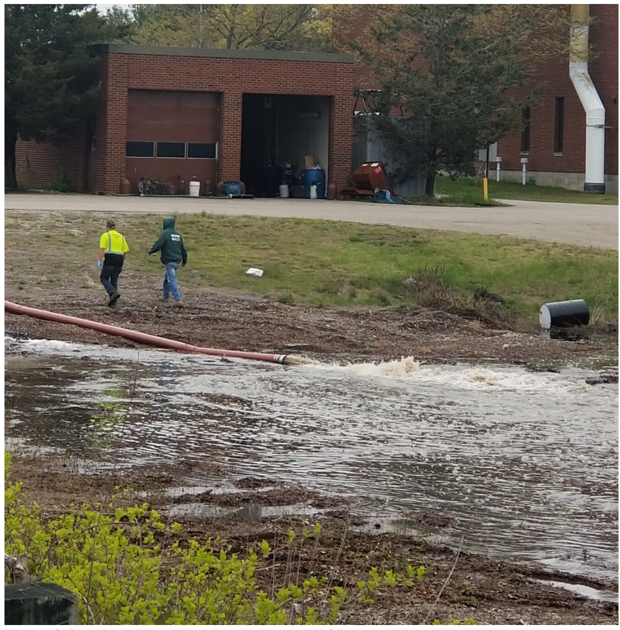
Figure 2.1 Non-Permitted Diversion at WPCF

and must be reported to Mass DEP. A number of these diversions have taken place at the WPCF in the last three years including prolonged diversions in spring 2018 and spring 2019. A photograph of the diversion is presented below.