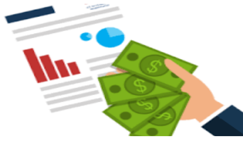
Microenterprise Grant Program for microenterprise businesses affected by COVID –19

This regional effort includes the Towns of Rockland, Abington, Avon, Holbrook, Hull, and Wareham. The program is designed to benefit small businesses owned by low- and moderateincome owner(s). The owners of the company must qualify as low- or moderate-income (LMI). Income eligibility is defined as owner(s) having a family income of no more than 80% of the median income for the geographic area in which they reside (not the geographic area in which the business is located). Program Staff will conduct an income-qualification process to determine applicants' eligibility.