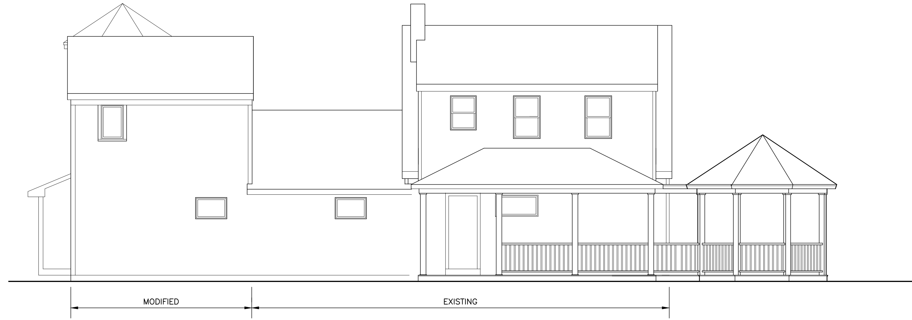
EAST ELEVATION SCALE: 3/16" = 1'-0"