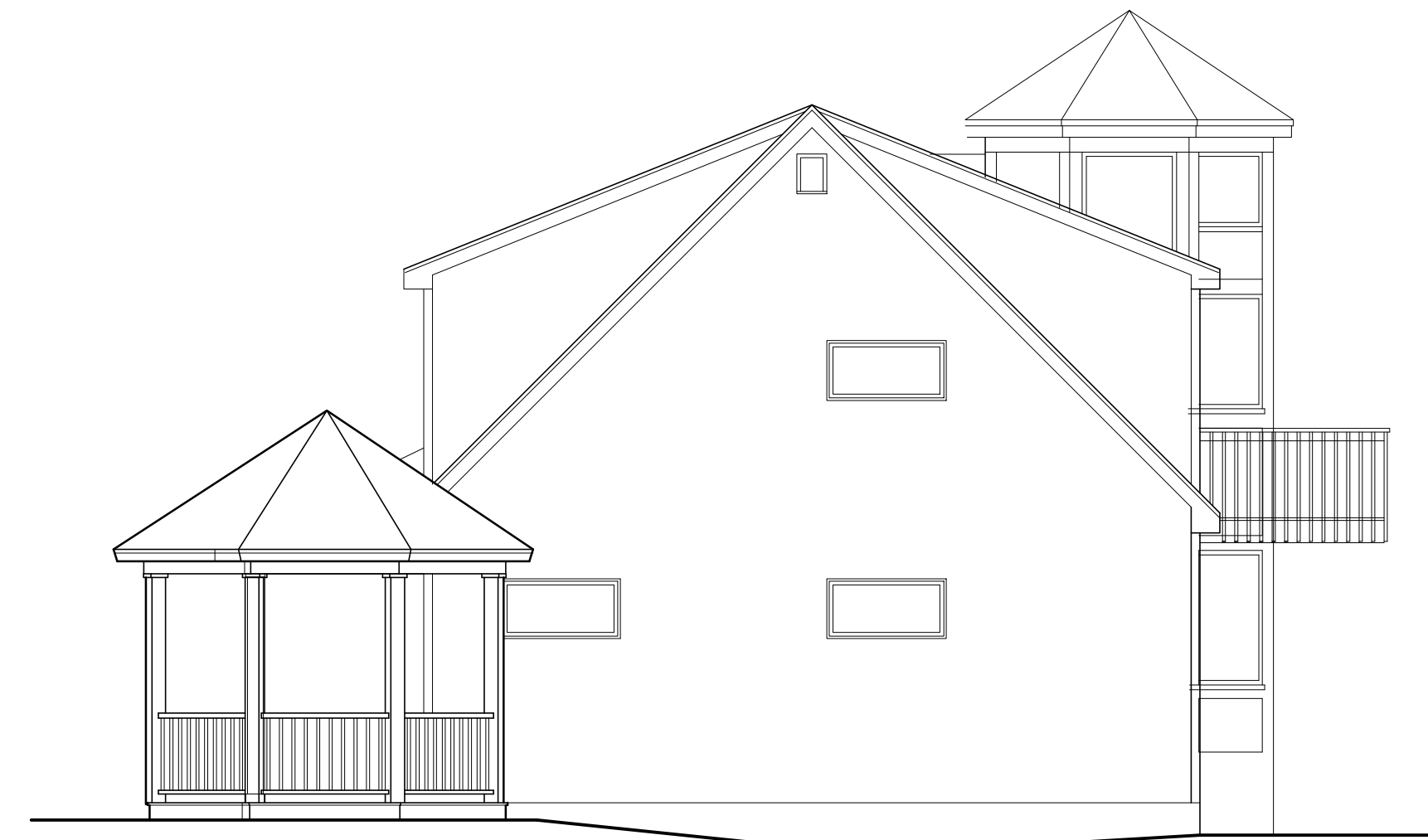
NORTH ELEVATION SCALE: 3/16" = 1'-0"