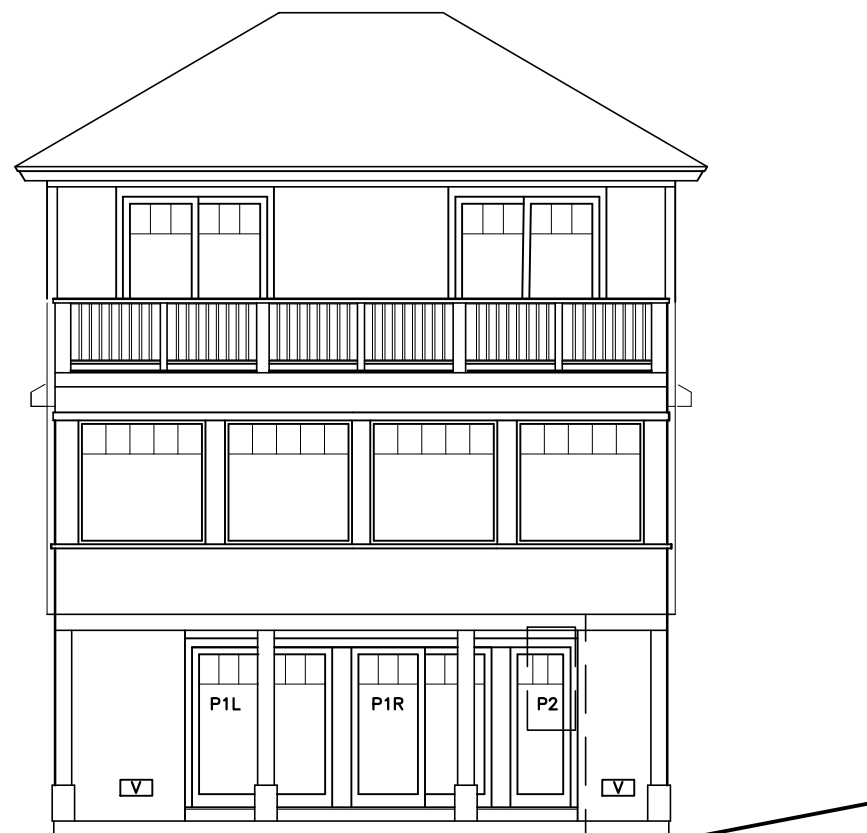
EAST ELEVATION SCALE: 3/16"= 1'-0"