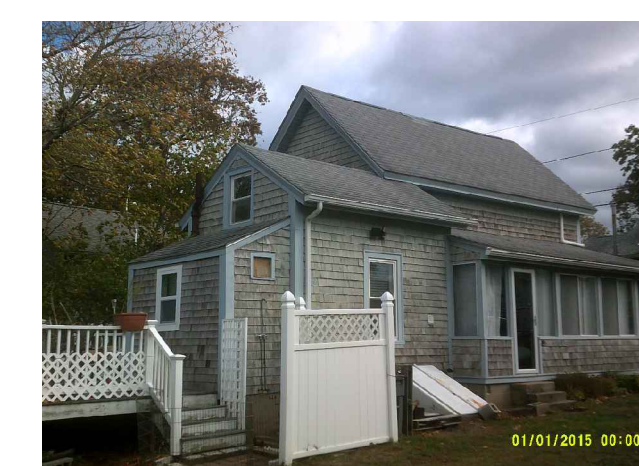
EXISTING WEST VIEW @ AREA OF ADDITION