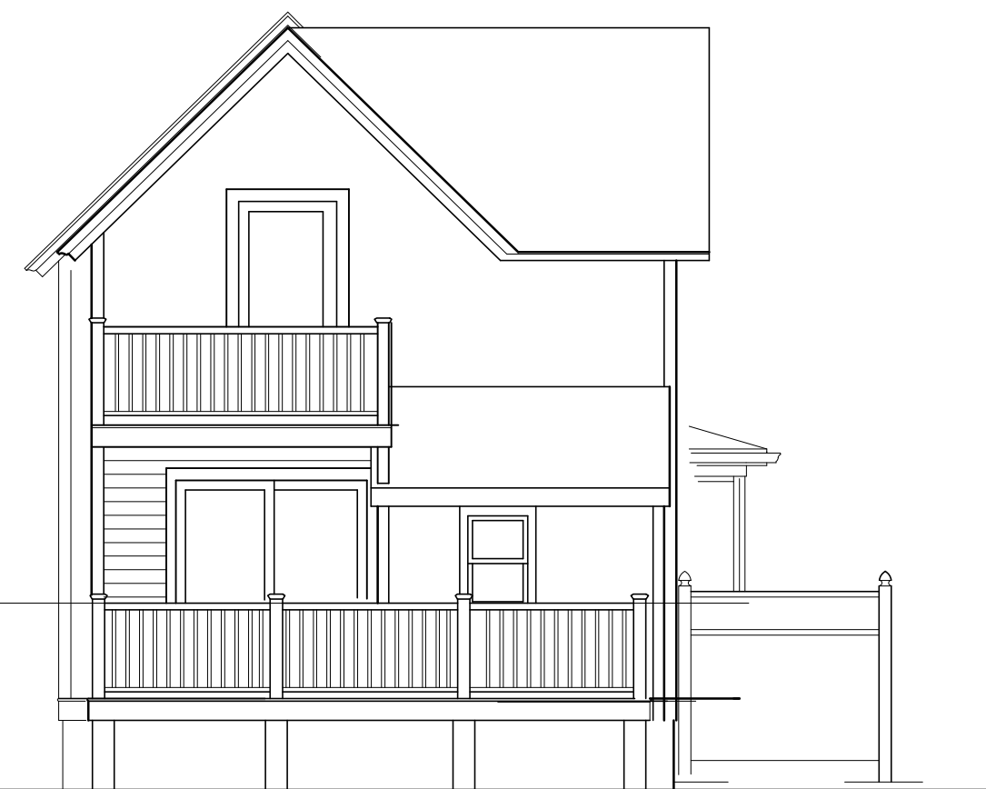
WEST ELEVATION SCALE: 3/16"=1'-0"

MAP 1, LOT 1036 BOOK 49160/PAGE 242 ZONING—RESIDENTIAL (OV2) LOT SIZE (MIN REQD) — 10,000 SF ACT — 4457± SF FRONTAGE (MIN REQD) — 50' ACTUAL — 50.51' SETBACKS FRONT (EAST) — AVERAGE OF ADJACENT — 14.5' EXISTING UNCHANGED — 13.8' SIDE, REAR (MIN REQD) — 10' SIDE (N) EXISTING UNCHANGED — 3.8' SIDE (S) EXISTING UNCHANGED — 21.6' REAR (W) EXISTING UNCHANGED — 17.7' HEIGHT (MAX ALLOWED) — 35' EXISTING UNCHANGED — 23'± BUILDING COVERAGE — 20% MAX EXISTING UNCHANGED — 26.9%± LOT COVERAGE — 50% MAX EXISTING UNCHANGED — 34.7%± FLOOR AREA RATIO — 25% MAX EXISTING — 32.7%± PROPOSED — 37.1%± FEMA MAP 255223 — ZONE AE14 TOWN SEWER TOWN WATER GAS