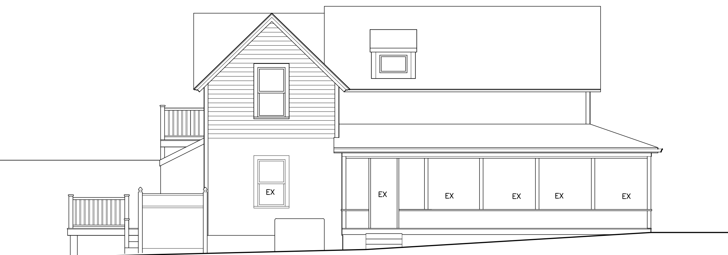
SOUTH ELEVATION SCALE: 3/16"=1'-0"