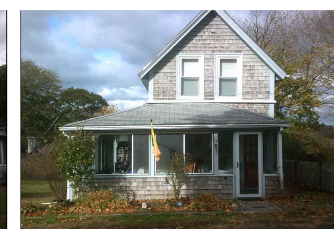
EXISTING EAST (FRONT) VIEW