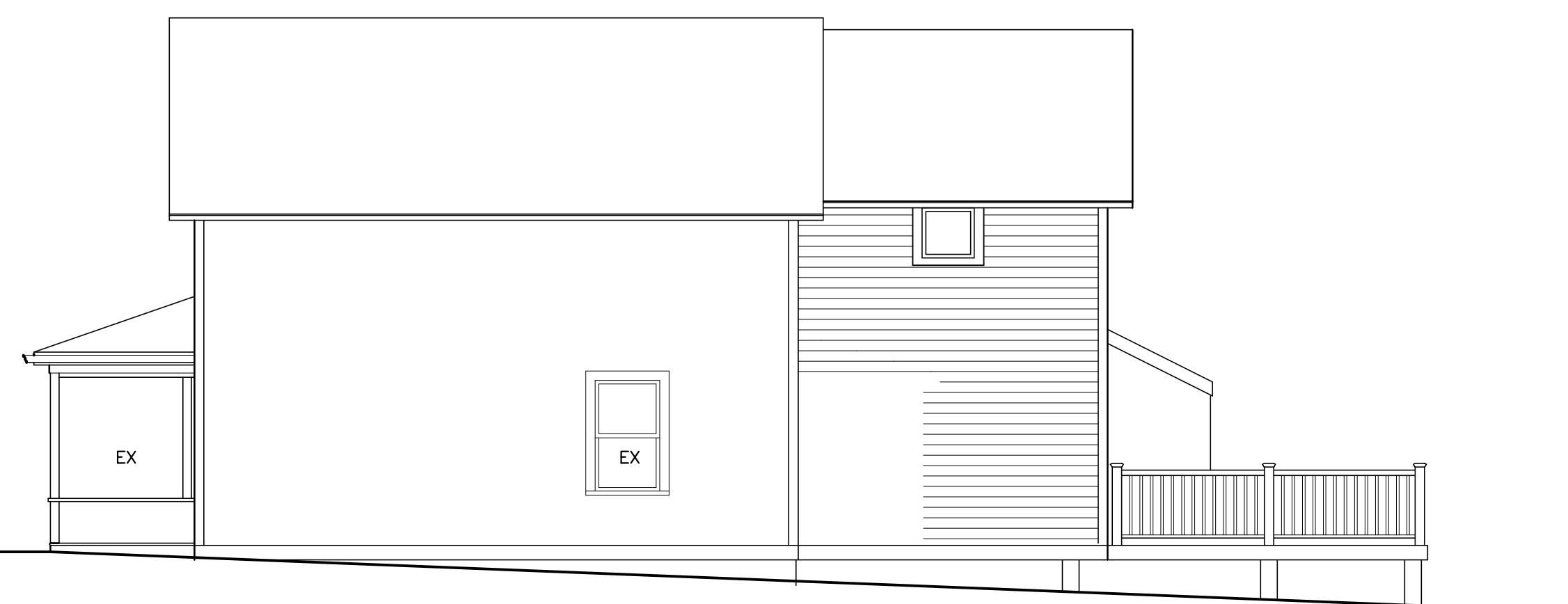
NORTH ELEVATION SCALE: 3/16"=1'-0"