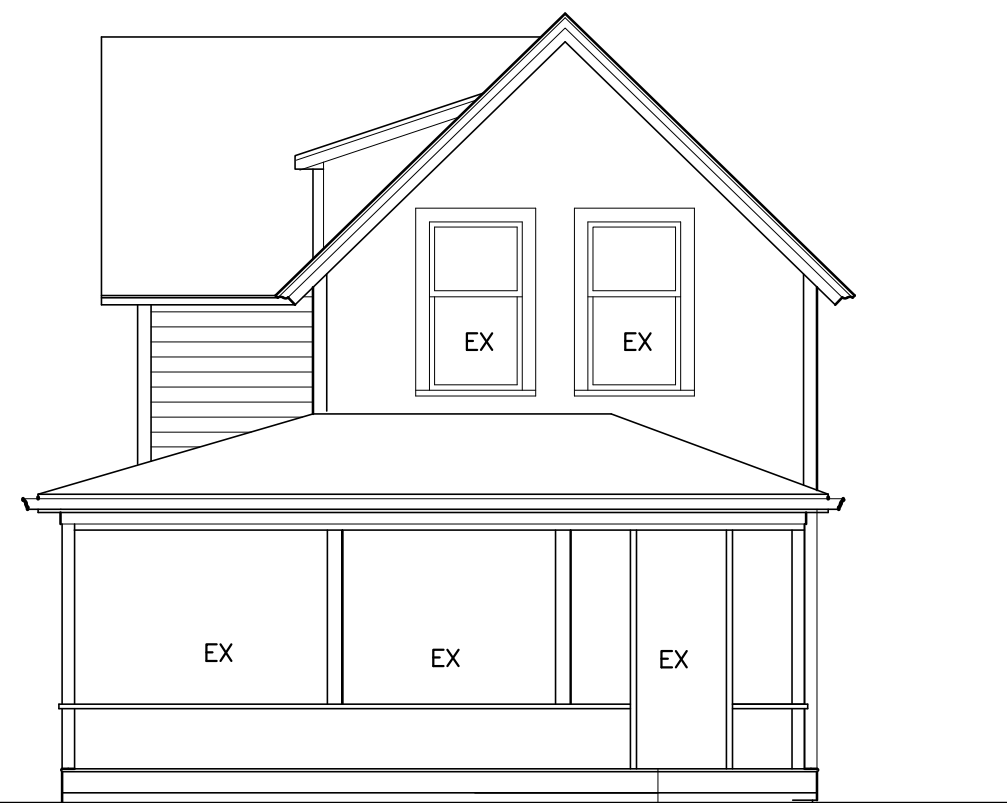
EAST ELEVATION (STREET) SCALE: 3/16"=1'-0"