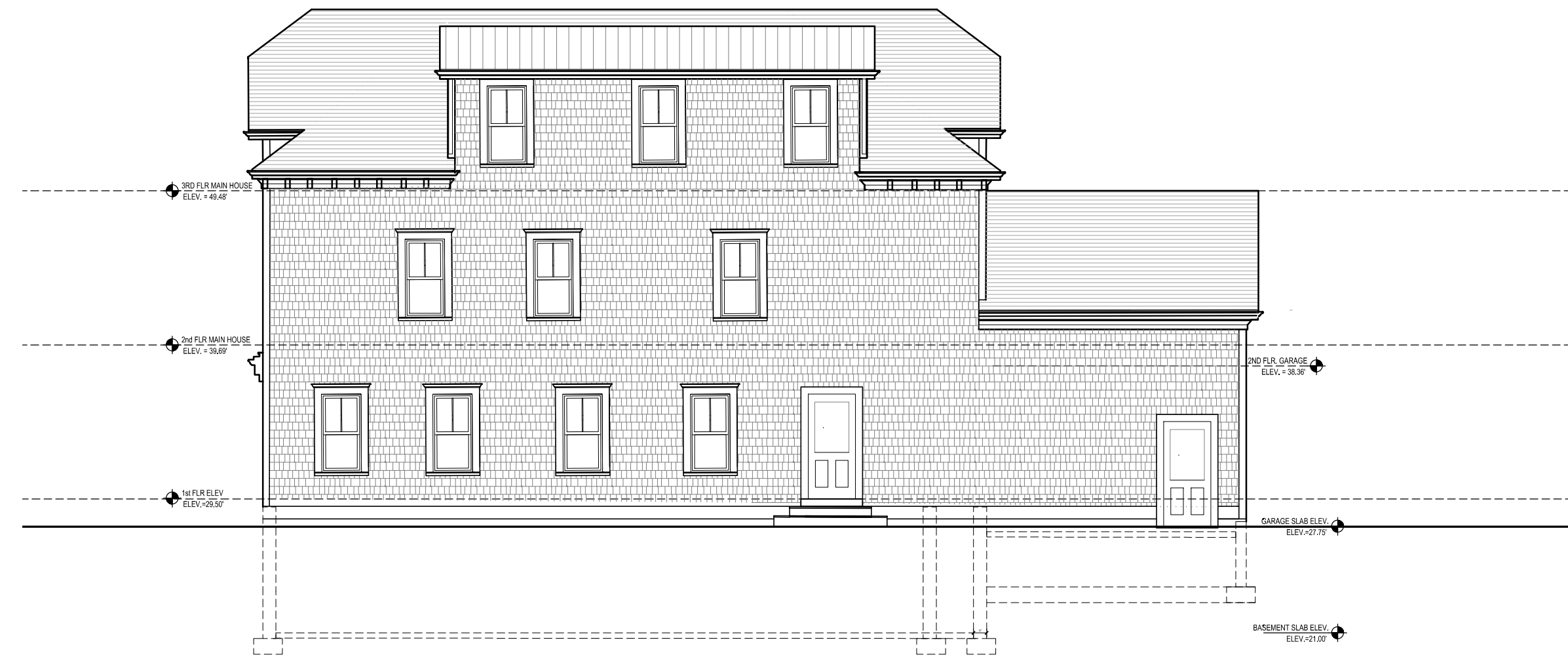
3 EAST ELEVATION SCALE: 1/8" = 1'-0"