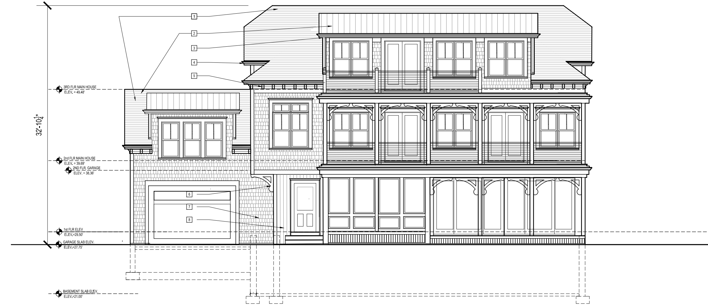
1 WEST ELEVATION SCALE: 1/8" = 1'-0"