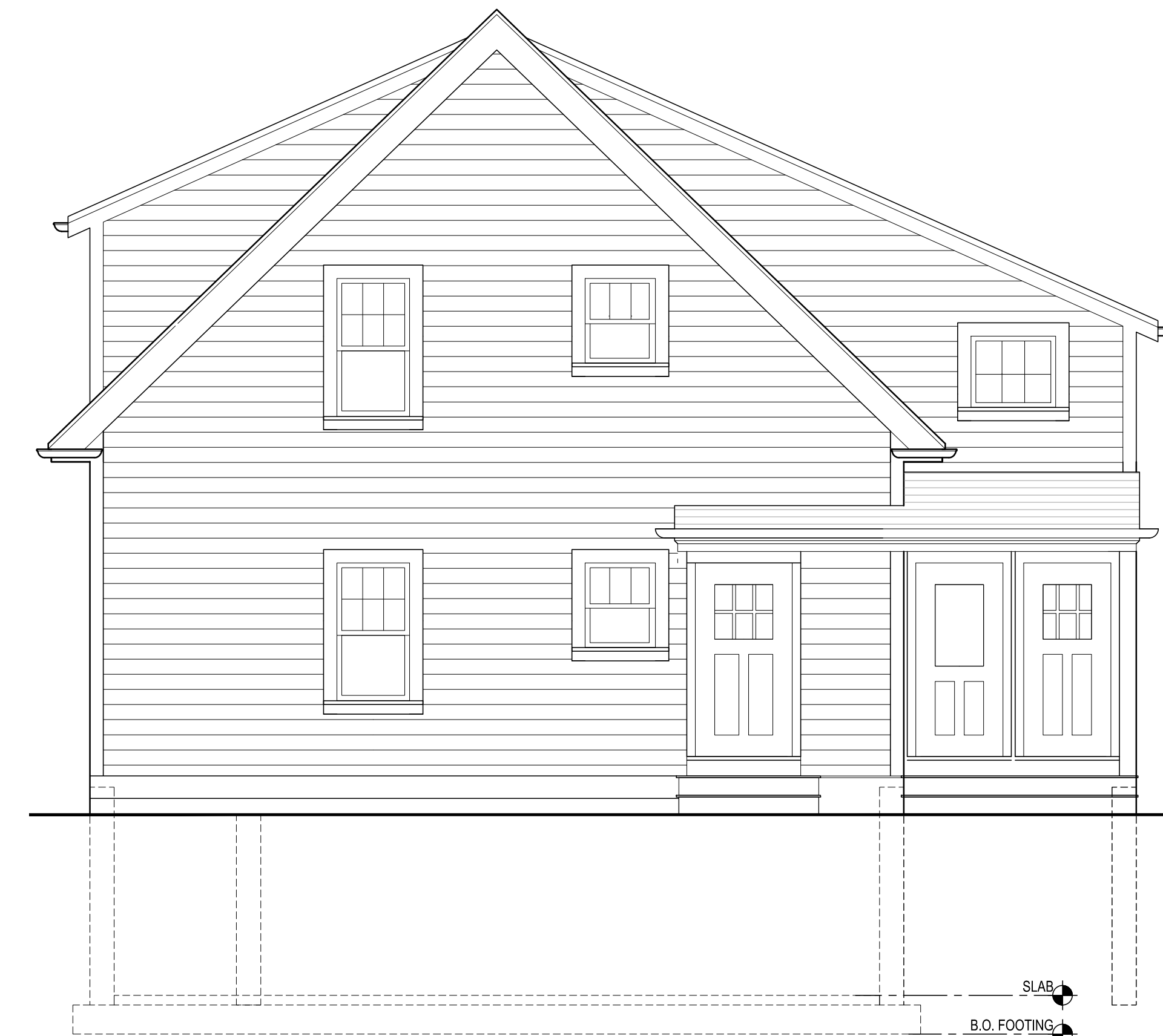
3 REAR ELEVATION (SOUTH) SCALE: 1/4" = 1'-0"