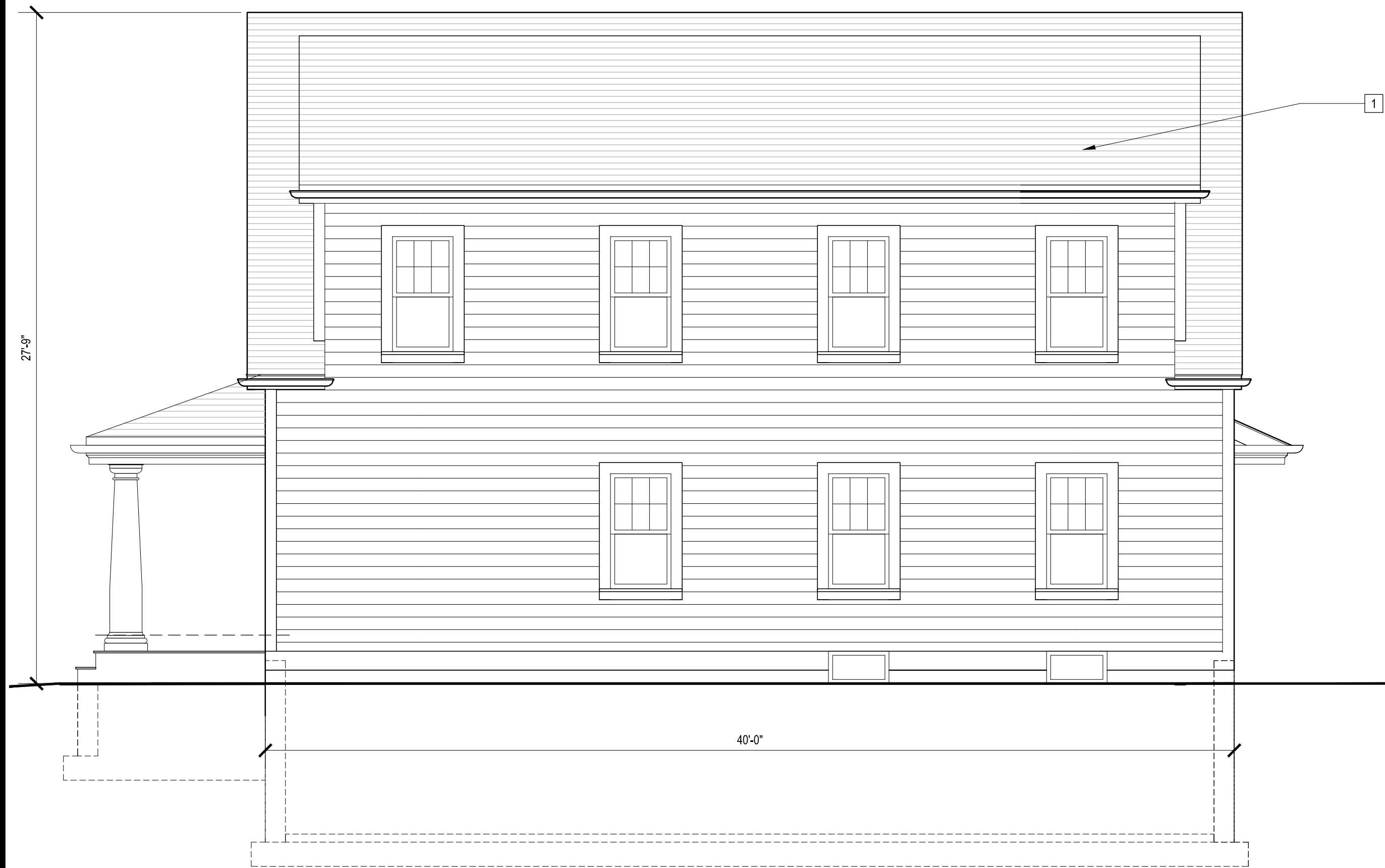
4 SIDE ELEVATION (WEST) SCALE: 1/4" = 1'-0"