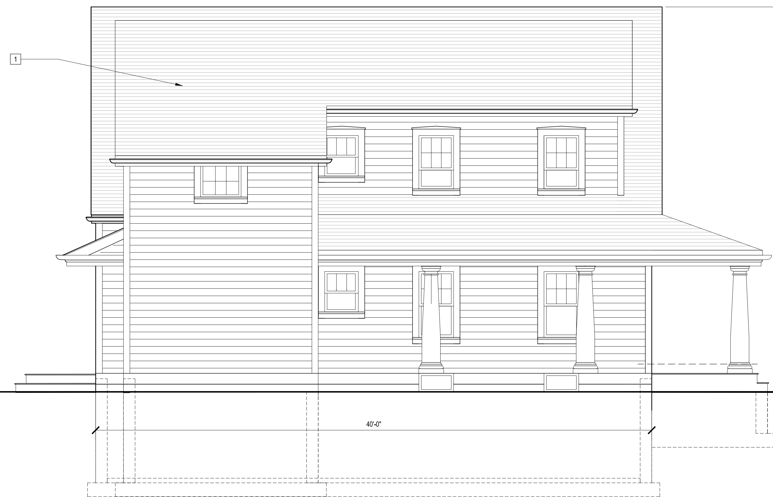
2 SIDE ELEVATION (EAST) SCALE: 1/4" = 1'-0"