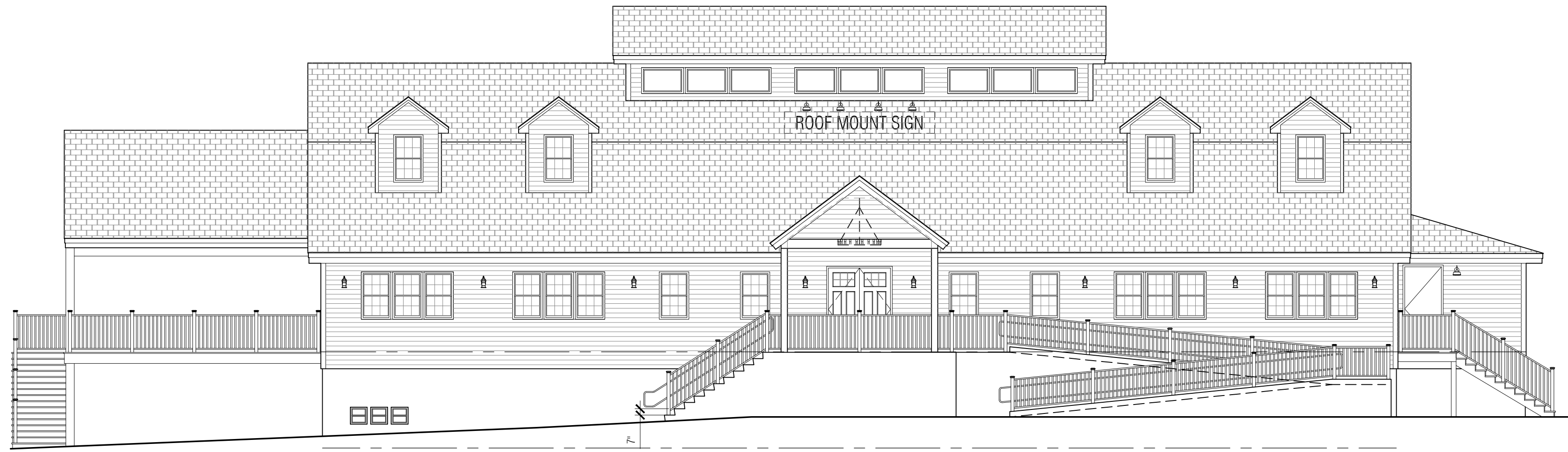
1 EXTERIOR ELEVATION - WEST 1/8" = 1'-0"

PER TOWN OF WAREHAM ZONING AVERAGE GROUND ELEVATION AS DEFINED BY: 780 CMR, MASSACHUSETTS BUILDING CODE GRADE PLANE ELEV. 9.9'