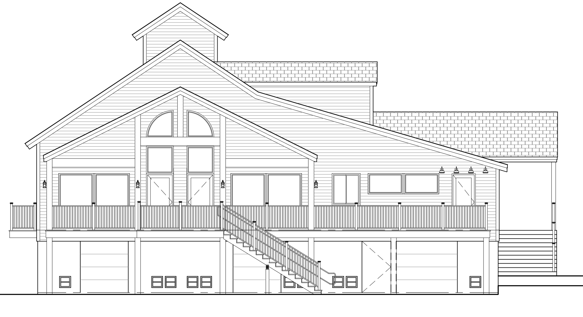
2 EXTERIOR ELEVATION - NORTH 1/8" = 1'-0"