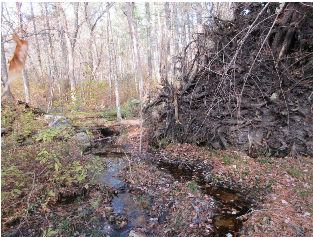
Stream next to Massive uprooted tree 2021