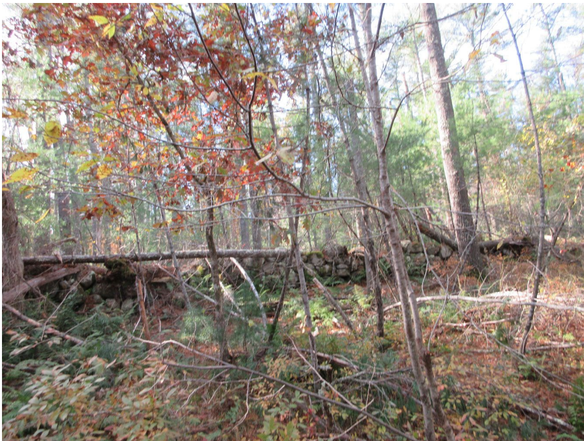
Westerly view from FHCA into proposed Wareham MA 3 solar project site 2020