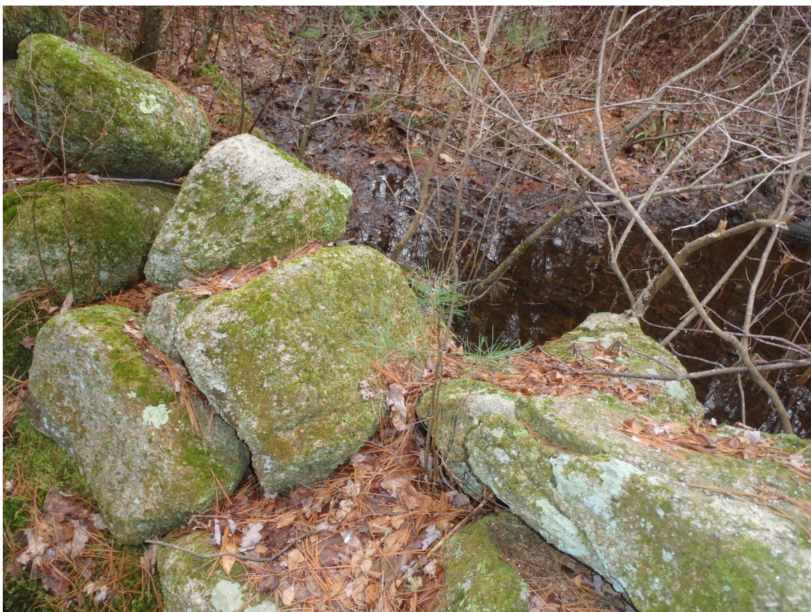
Stone wall next to standing water