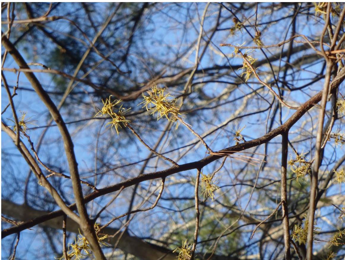
Hamamelis virginiana- Witch hazel tree 2005