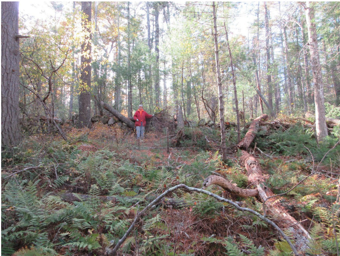
Looking west from FHCA into proposed Wareham MA 3 solar project site 2021