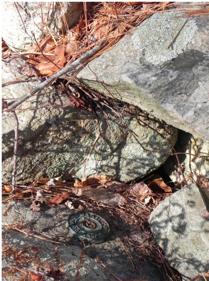
Land court marker 2015