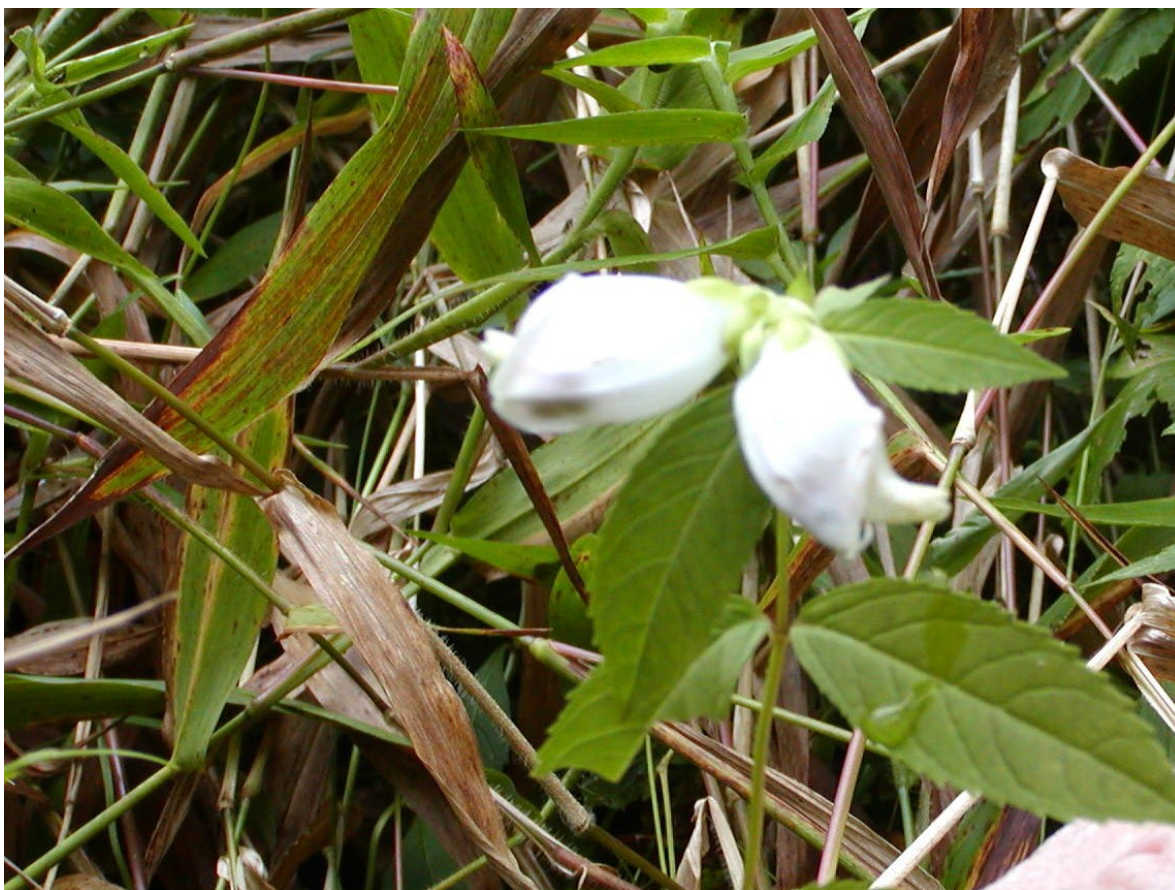
Chelora glabra - White Turtlehead plant FHCA 2005