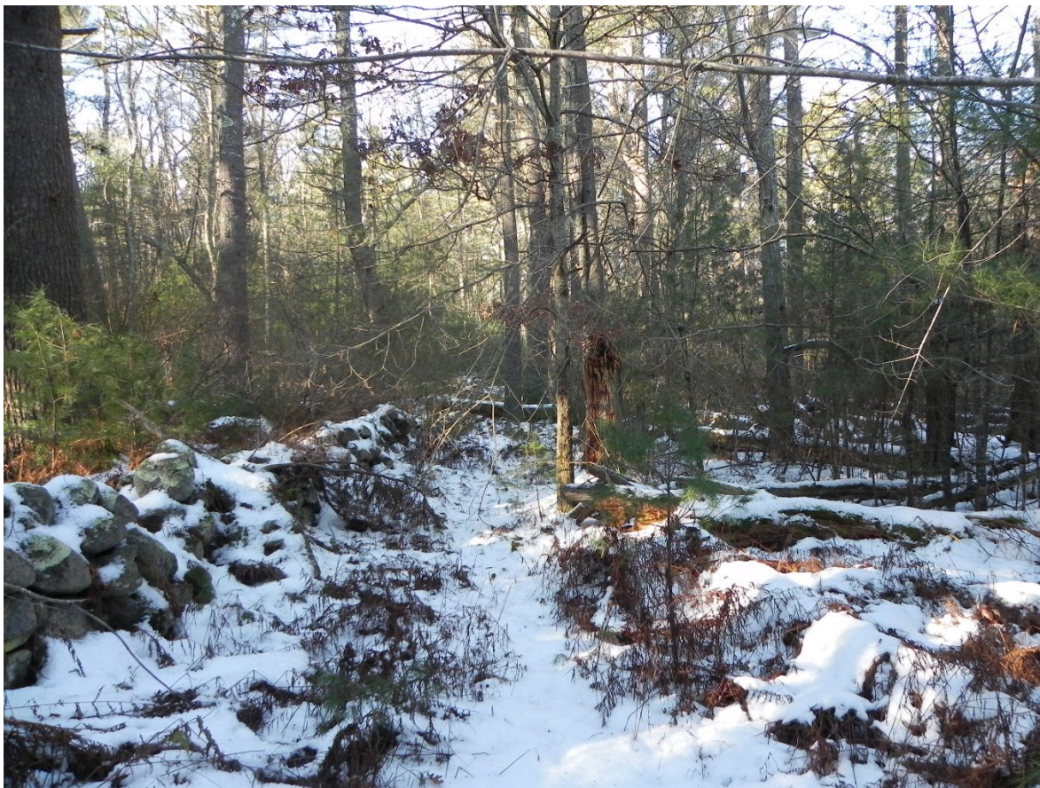
Stone wall Western bound of Fearing Hill Conservation area 2013