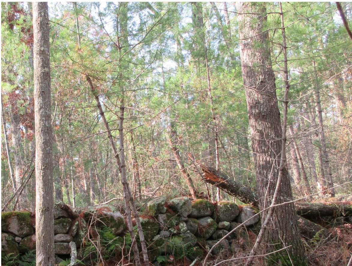
Stone wall western bound of Fearing Hill Conservation Area 2019