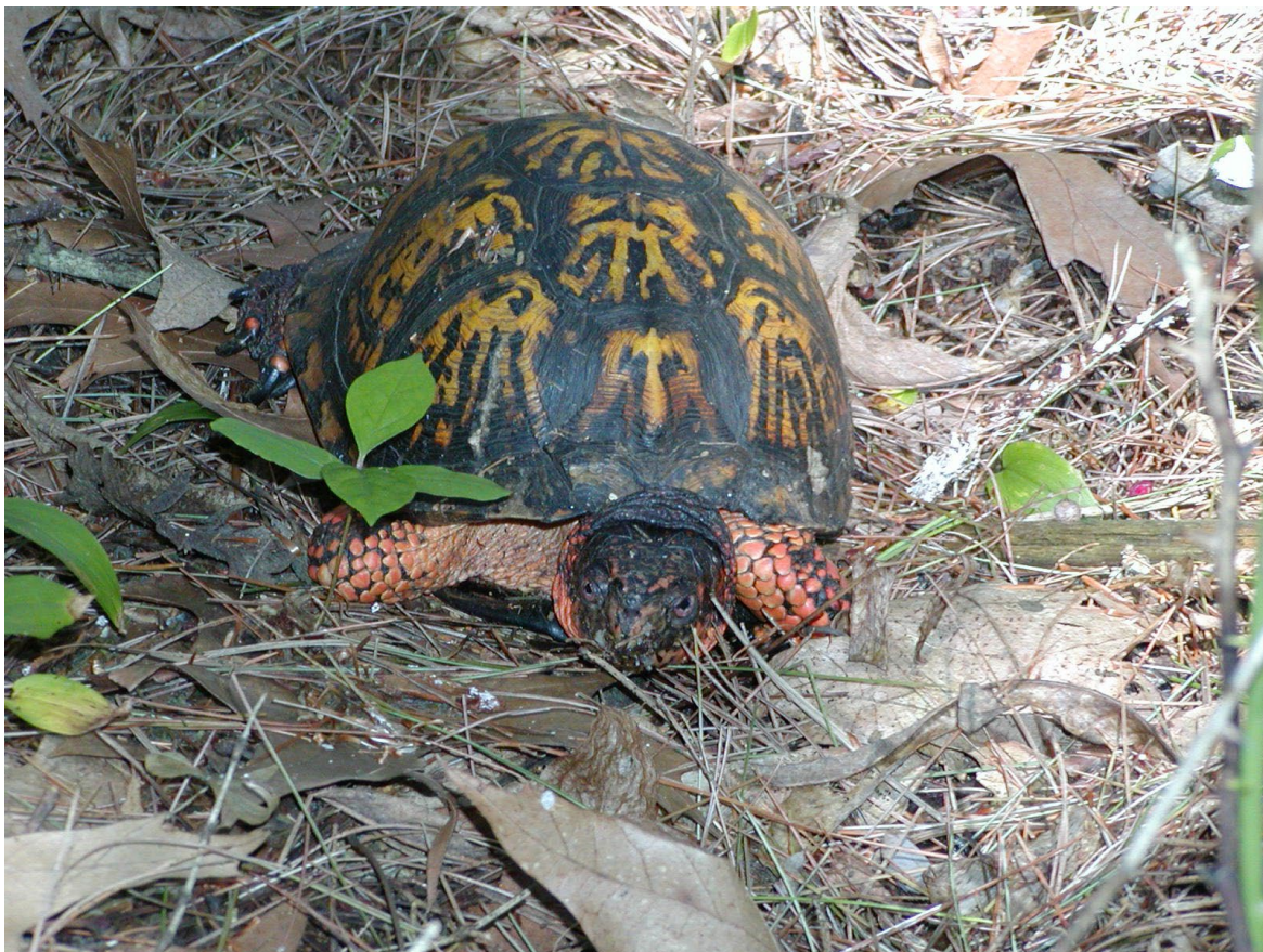
Box turtle FHCA 2003