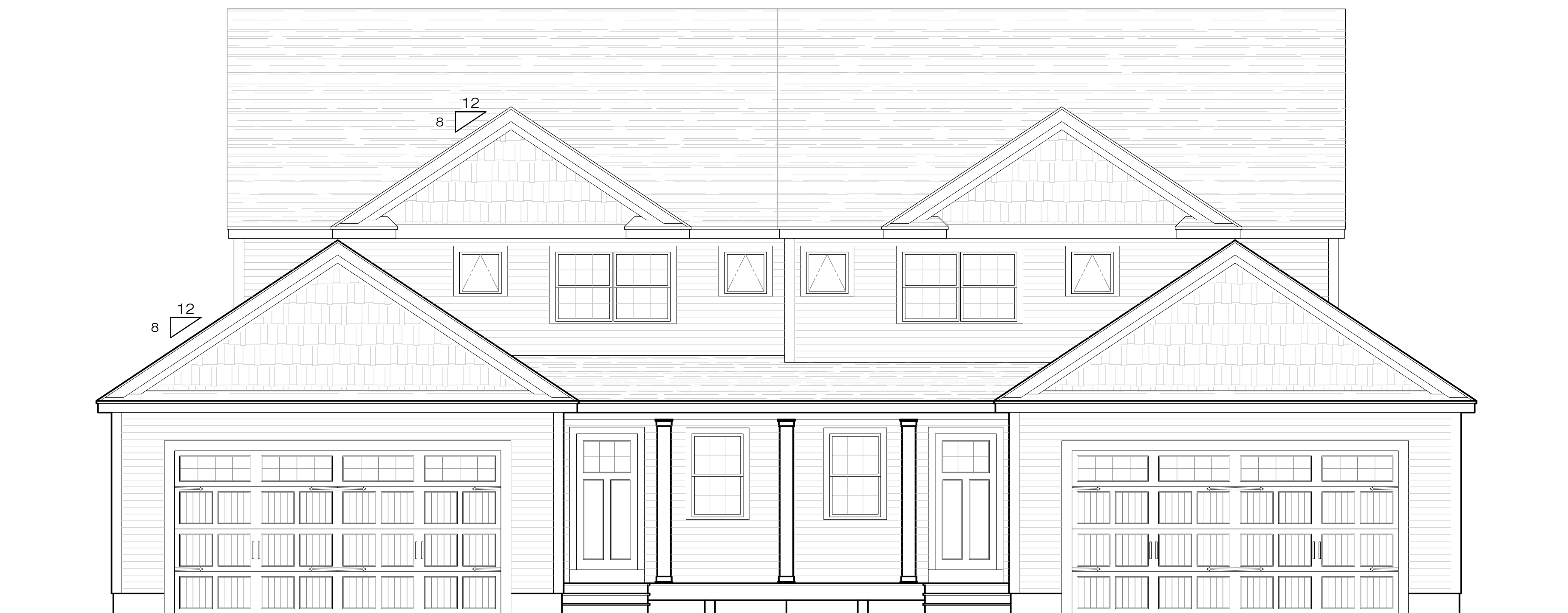
○ ALDEN 1 FIRST FLOOR PLAN 1,571 SQ. FT. PER UNIT