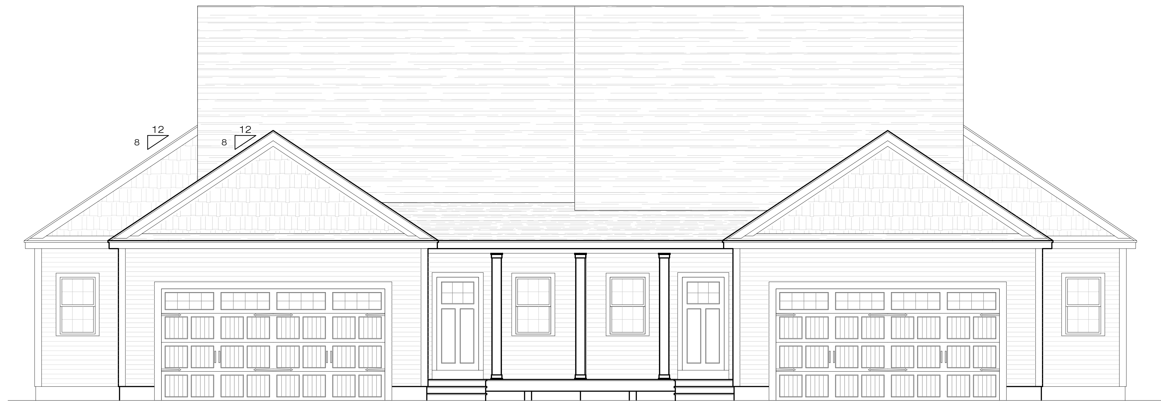
ALDEN 2 FIRST FLOOR PLAN 1,651 SQ.FT. PER UNIT