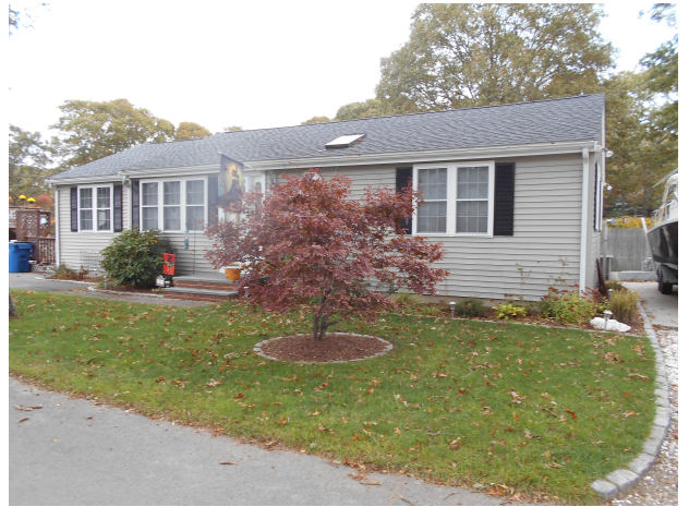
( https://images.vgsi.com/photos2/WarehamMAPhotos/\00\03\37\04.jpg )