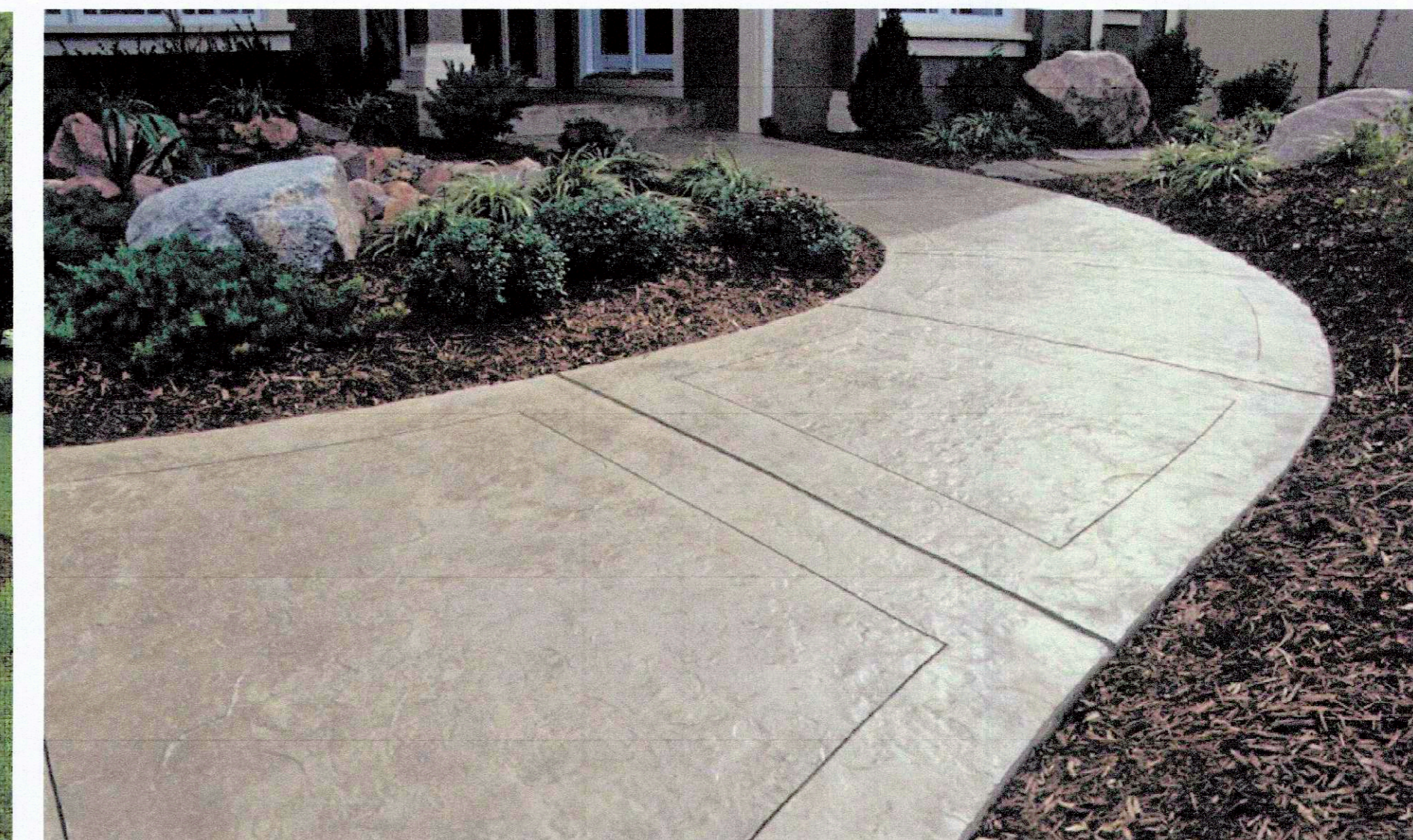
REPRESENTATIVE CONCRETE WALKWAY