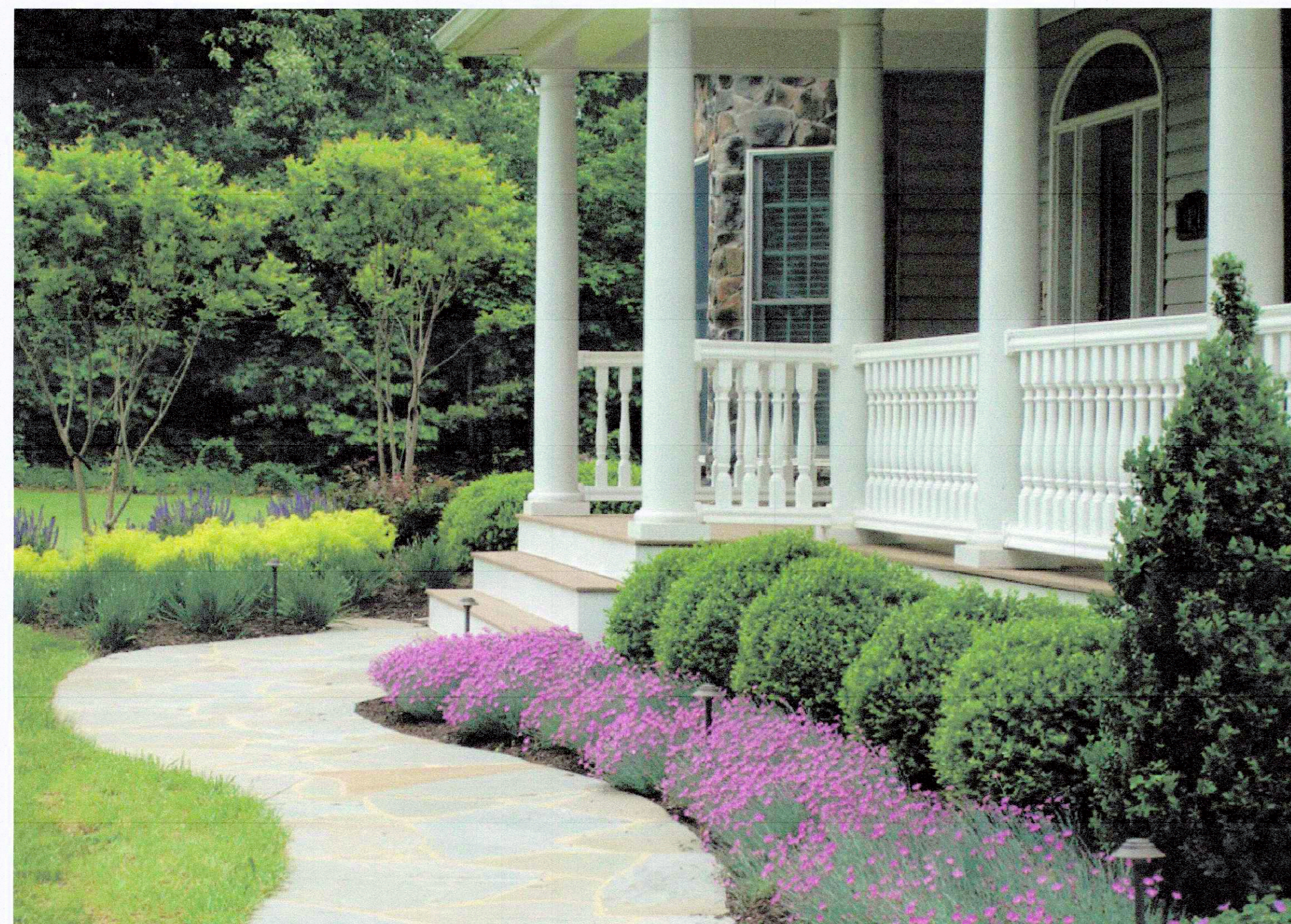
REPRESENTATIVE ENTRANCE LANDSCAPE