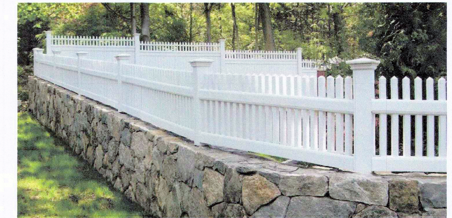
PICKET FENCE ON RETAINING WALL