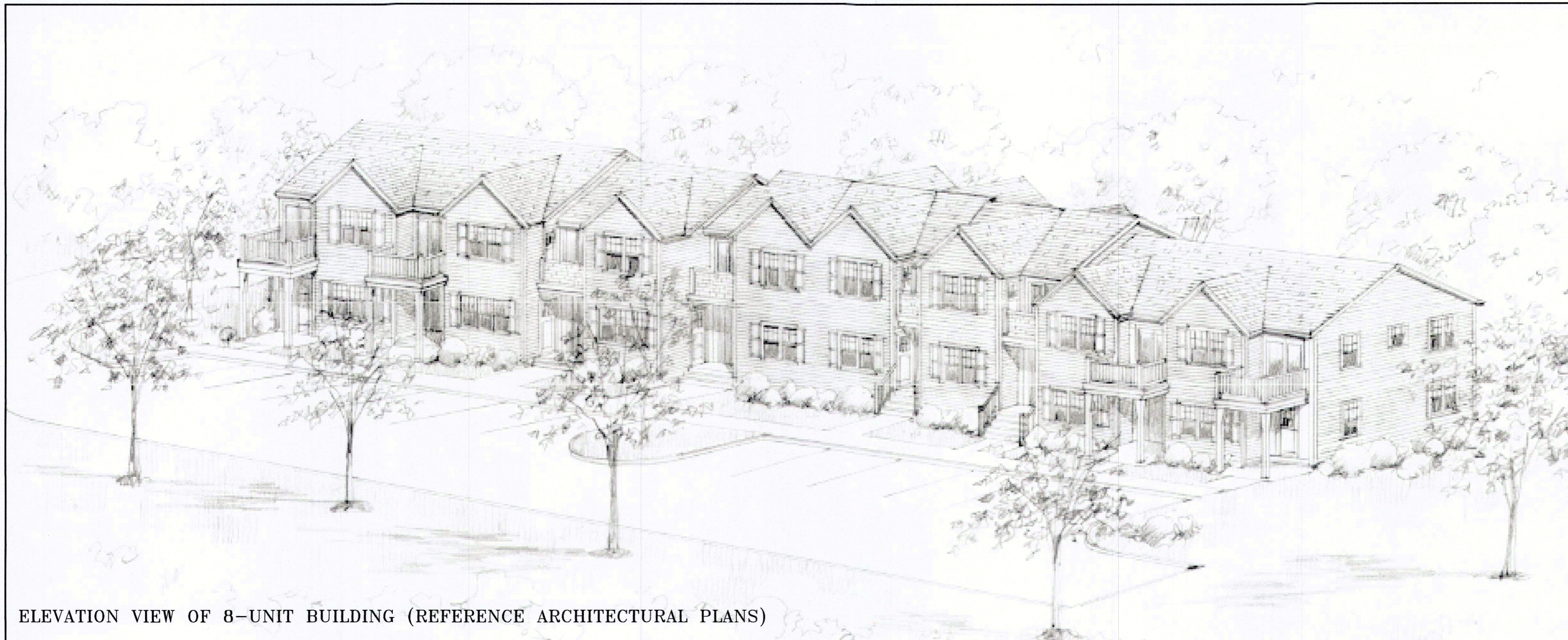
ELEVATION VIEW OF 8-UNIT BUILDING (REFERENCE ARCHITECTURAL PLANS)