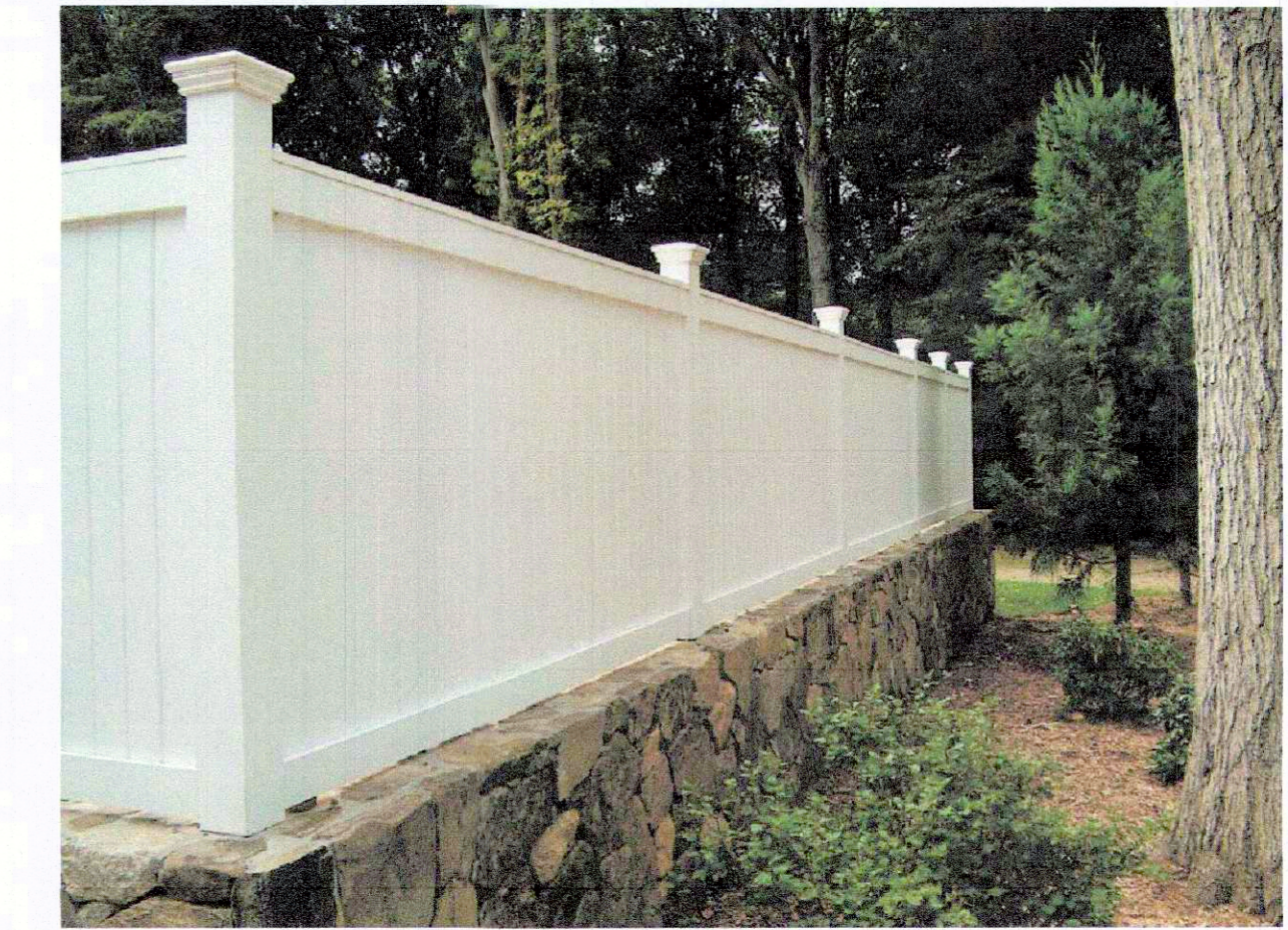
SCREEN FENCE ON RETAINING WALL