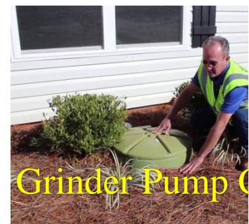
Grinder Pump Cover

Wareham WPCF is responsible for their maintenance. The WPCF is responsible for operation, maintenance, repair and replacement of the Grinder System. The homeowner will be charged a "Service Call Charge" if the WPCF services the pump and the maintenance is due to negligent flushing per Town of Wareham Policy 28.