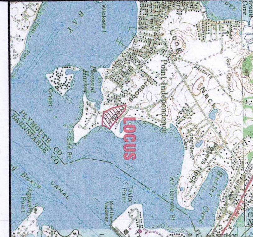
LOCUS MAP : SCALE 1" = 2000'

EX. CONDITIONS PLAN SCALE: 1" = 40' 0 40 80 160