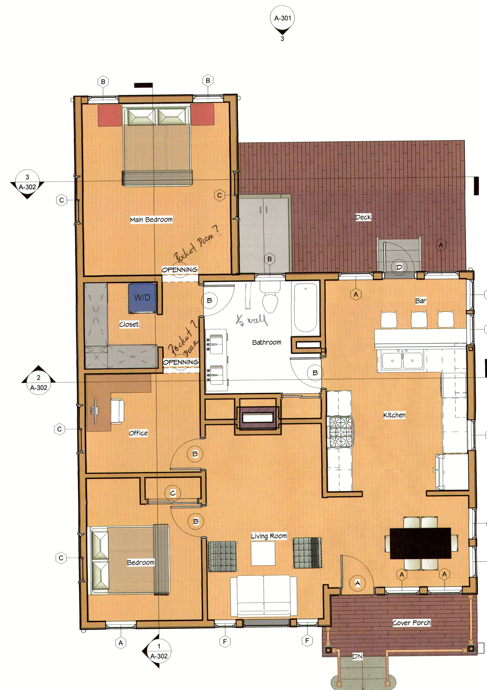
1 FIRST LEVEL - ARCHITECT - Proposed 1/4" = 1'-0"

Project : Bedroom Rear Addition & Interior Modification