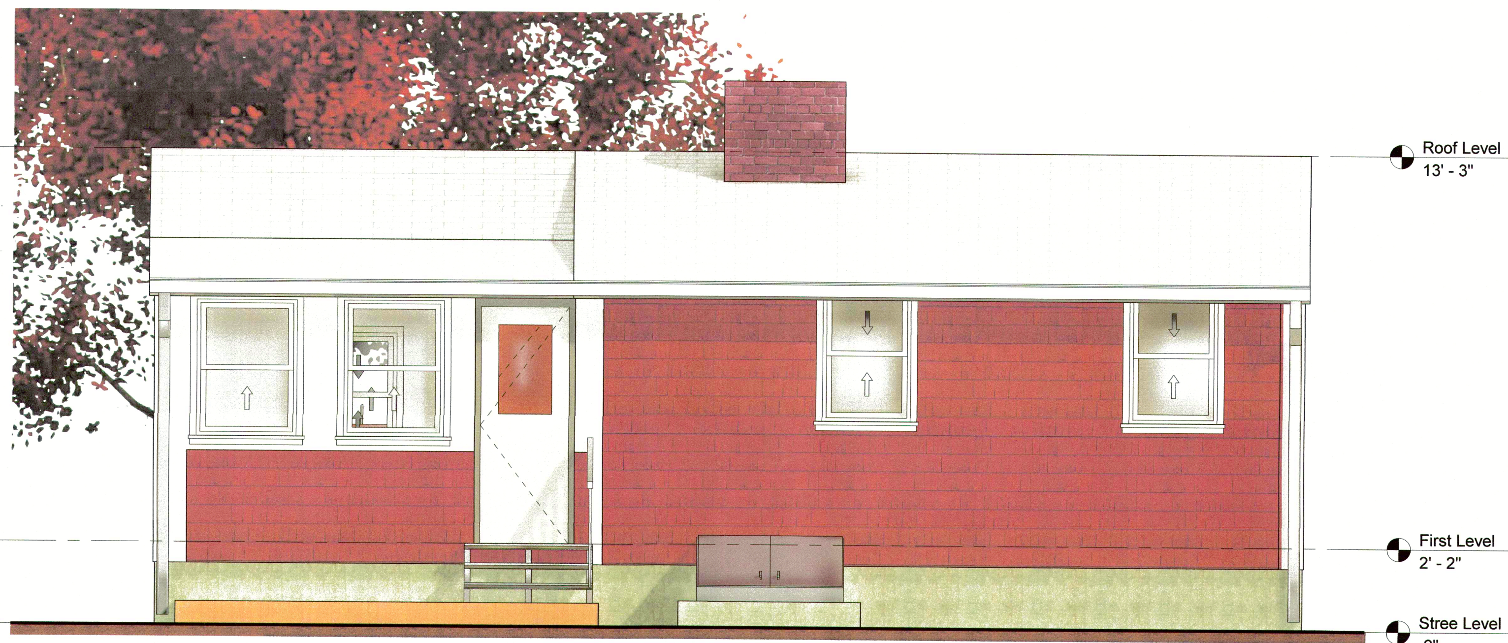
3 REAR ELEVATION - Existing 3/8" = 1'-0"